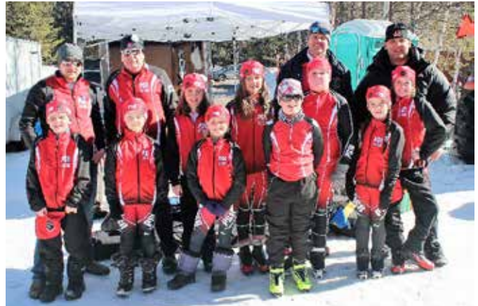
The PSR JD Ski Team and coaches at the Ontario Cup #4

however, many of these young athletes demonstrated their dedication to the sport by training an additional 2-4 times each week on their own. As a result, they were able to reach impressive distance goals, including some racers skiing upwards of 450km in the season!